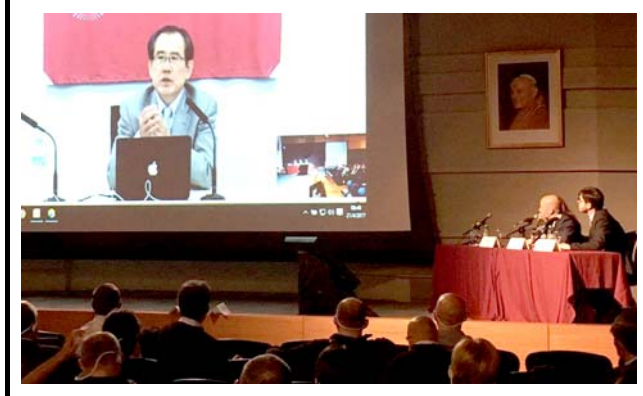
Discussions between chairs and presenters.