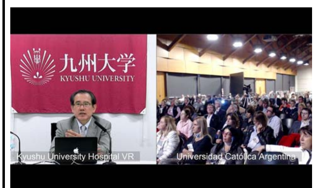
Monitor shows connected sites.