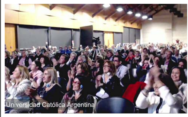
There are many participants in Argentina venue.