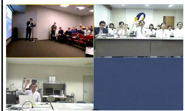
Monitor shows connected sites.