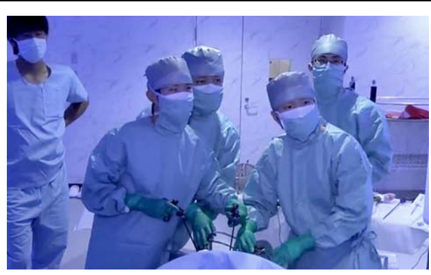
A presented movie.