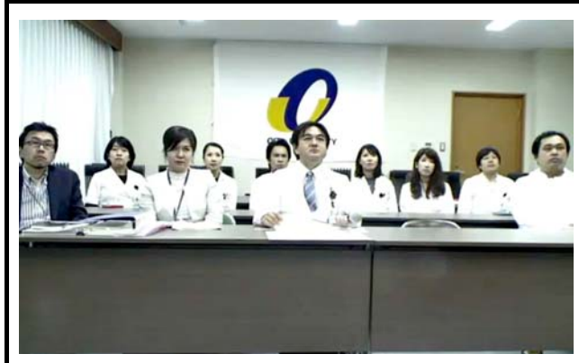
Teleconference view at Oita University.