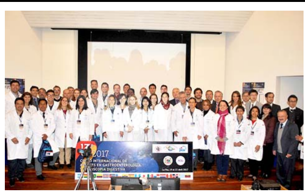
A group photo at main venue.