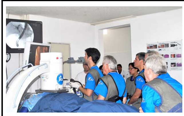
The scene of endoscopic surgery.