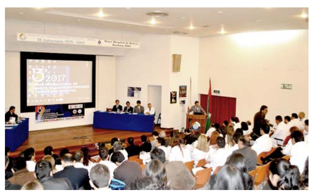
Teleconference view at Bolivian-Japanese Gastroenterology Institute.