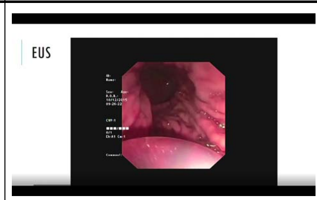
A presented endoscopic movie.