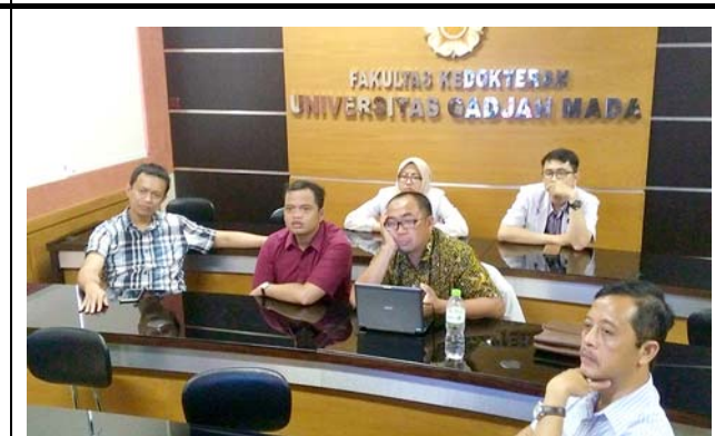
Teleconference view at Gadjah Mada University.