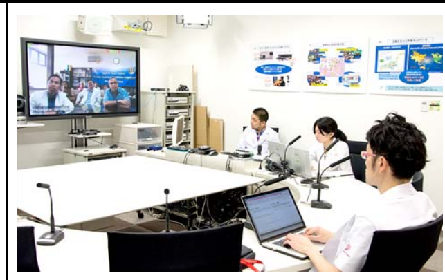
Teleconference view at Kyushu University Hospital.