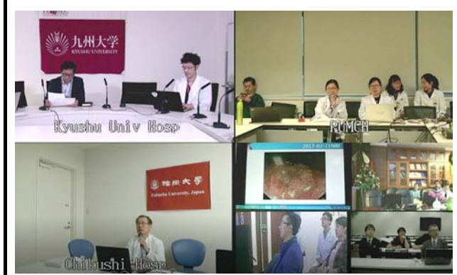
Monitor shows connected sites.