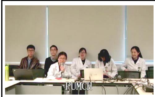
Teleconference view at Peking Union Medical College Hospital.