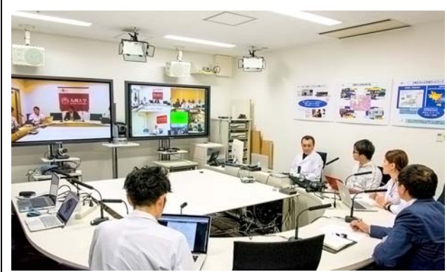
Teleconference view at Kyushu University Hospital.