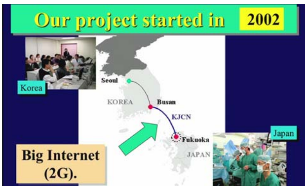
Teleconference view at St. Luke's Medical Center Quezon City. Picture taken at: Kyushu University Hospital