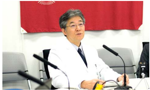
Teleconference view at Kyushu University Hospital.