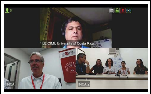
Monitor shows 3 sites.