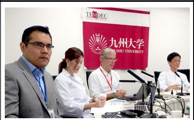
Teleconference view at Kyushu University Hospital.