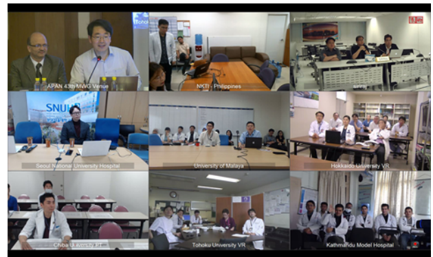
Teleconference view at Hokkaido University.