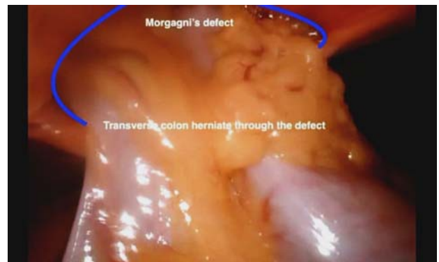
A presented movie of CT.