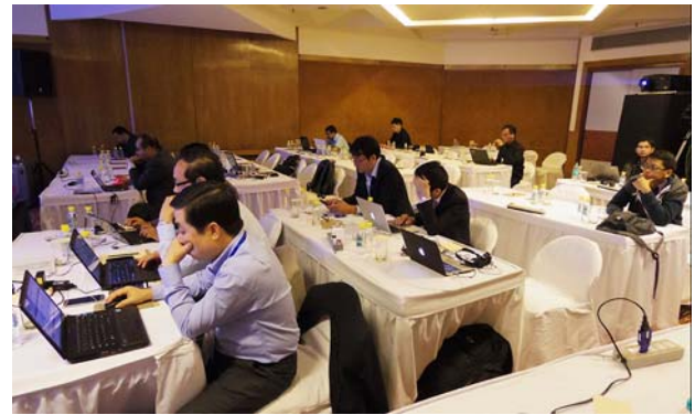
Teleconference view at Mahidol Univ Siriraj Hosp.