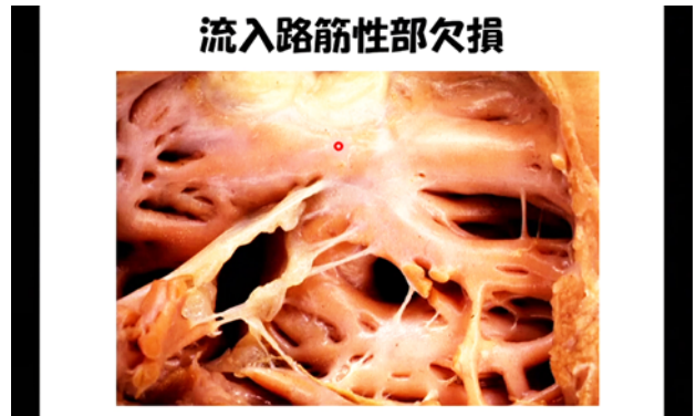
A presented slide.