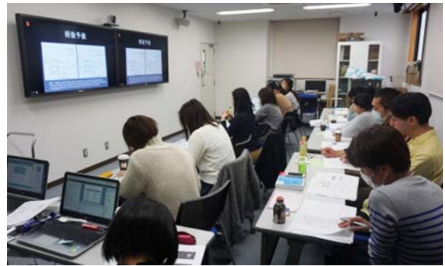
Teleconference view at Keio University.