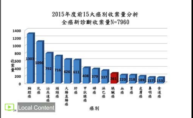
A presented slide. Picture taken at: Kyushu University Hospital