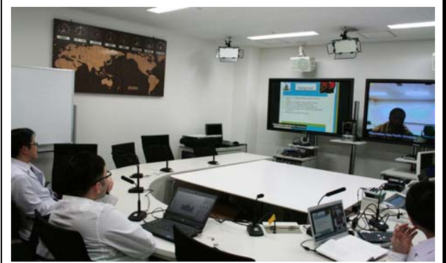
The teleconference view with connected 2 sites. Picture taken at: Kyushu University Hospital