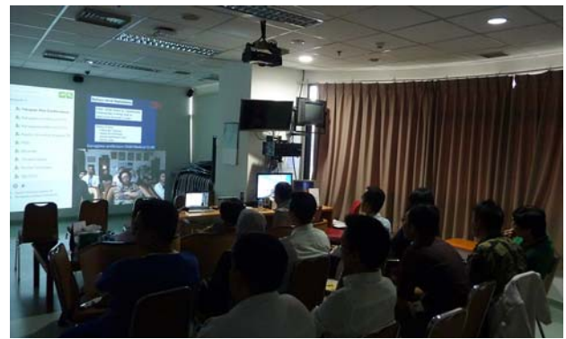
Teleconference view at Kanagawa Children's M. Center.