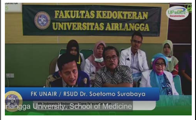
Teleconference view at Airlangga University.