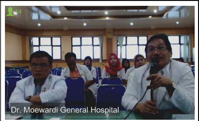
Teleconference view at Dr.Moewardi Hospital.