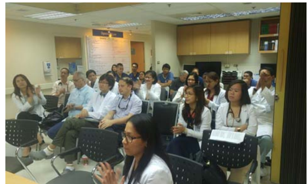
Teleconference view at Kobe University. Teleconference view at St. Luke's Medical Center. Picture taken at: Kyushu University Hospital Picture taken at: St. Luke's Medical Center