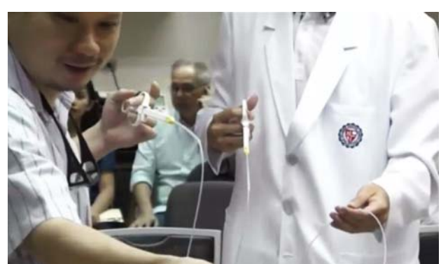
Monitor shows 3 connected sites. Explanation of operation with medical appliance. Picture taken at: Kyushu University Hospital Picture taken at: Kyushu University Hospital