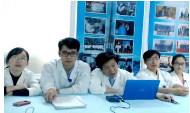
Teleconference view at JW Marriott Hotel Hanoi.